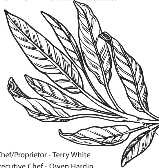
Chef/Proprietor - Terry White Executive Chef - Owen Hardin

Our food is carefully crafted and made to order, please use this time to enjoy your company. Consuming raw or under cooked meats, poultry, seafood, shellfish or eggs may increase your risk of foodborne illness. Please let your server know of any allergies or dietary restrictions you have. Parties of six or more will have 20% gratuity automatically applied to the check. All outside desserts will incur a fee of $5 per person in your party. Corkage fee is $25 per bottle with a 2 bottle maximum. Magnum Corkage fee is $50 per bottle with a 1 bottle maximum.